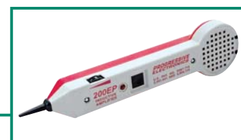
200EP includes spare duckbill and metal tip ▲