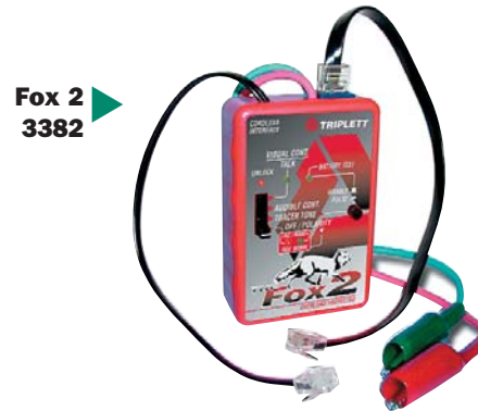
Fox 2 3382 ▲