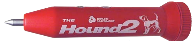
Hound 2 3236 ▲