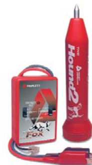
3245-K (case not shown) ▲