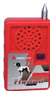
Hound Probe 3390 ▲